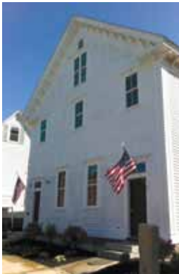
Durham’s historic Grange Hall

Produced in partnership with Rockingham Planning Commission. Sponsored by Donahue Tucker & Ciandella, PLLC.