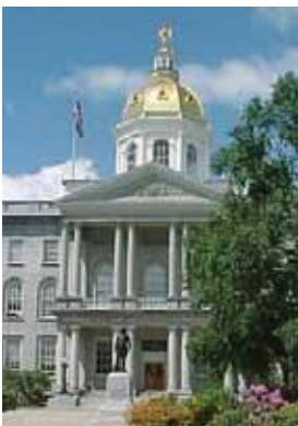
NH State House